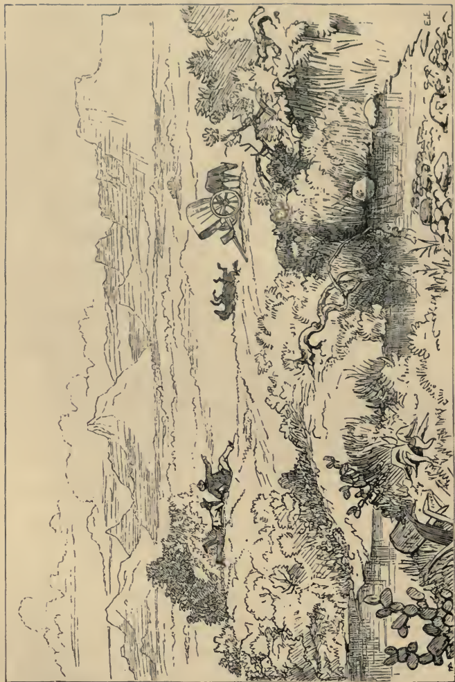
OUTSPANNED ON THE KARROO.—PAGE 89.